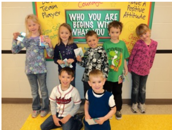
Kindergarten April Birthdays